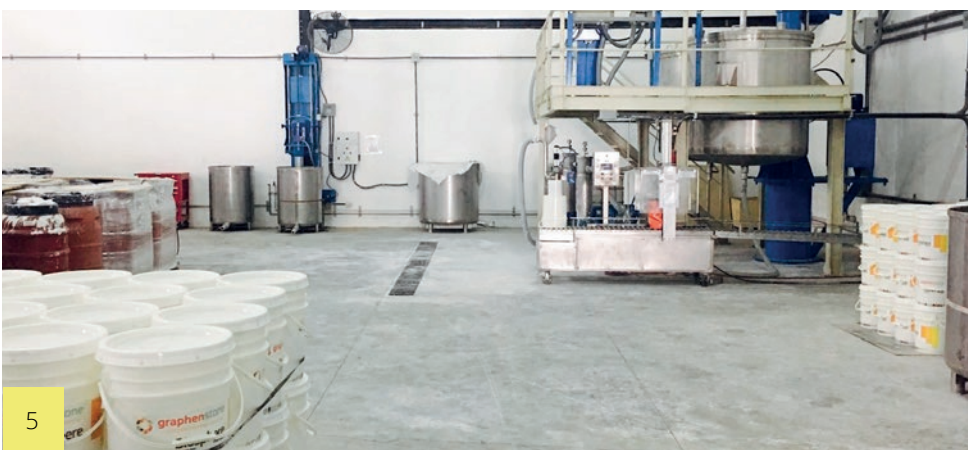
1. Image of the entrance of the main warehouse, Graphenstone China Factory (Jinan). 2. Meeting of the leadership of Graphenstone China (Jinan). 3. Main warehouse, Graphenstone Panama. 4. New facade decoration of the Graphenstone Panama Factory. 5. Industrial paint mixers in the production area, Graphenstone Panama Factory.